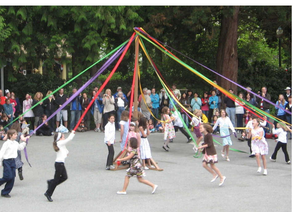
Leigh Elementary schoolchildren in Maypole dance, Victoria Day.