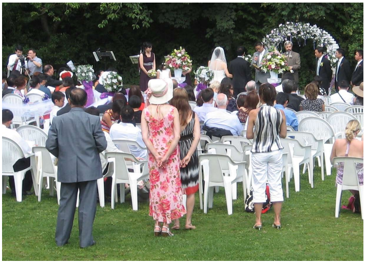
Wedding in Carousel Meadow.

Village Scavenger Hunt, March 16-22 Summer Season, May 1-September 7 Haunted Village, October 28-30 Heritage Christmas, November 21, 2009-January 3, 2010