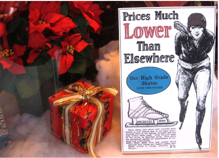
Heritage Christmas display.