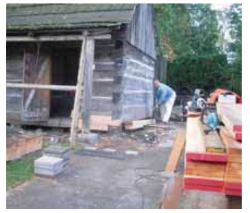
Repairing log cabin foundations.