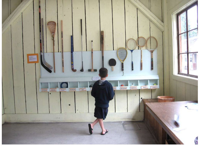
Stride Studio temporary exhibit: Glory Days.