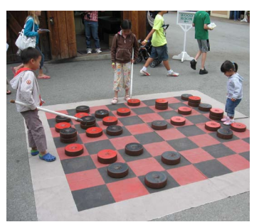
Visitors enjoy the giant checkers game.