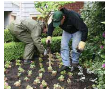
Working in the gardens.

"It was the best field trip ever." Guest Comment book, June 2